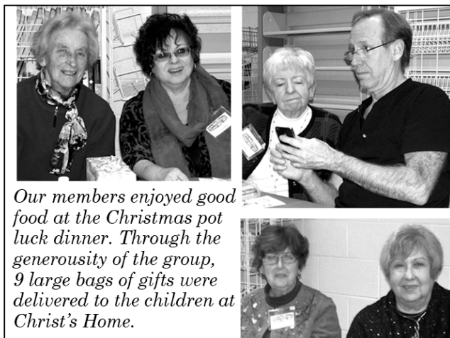
Our members enjoyed good food at the Christmas pot luck dinner. Through the generosity of the group, 9 large bags of gifts were delivered to the children at Christ's Home.