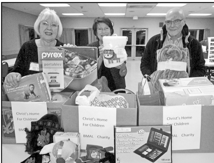
Gifts that were donated for the children at Christ's Home

Please send all news to me at parkda11@verizon.net or 215 674-4292